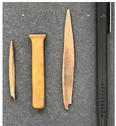
Three artifacts discovered in 2021 by McGrath students from the Tochak site: bone awl, labret unidentified animal remains. Also and bone awl (black pencil for scale).

Recent archeological work at the Tochak site in McGrath has produced a broader story of ancient lifeways in the Upper Kuskokwim River. Located behind the McGrath School on MTNT land, the site has evidence of at least two different subsistence camps dating around 300 and 500 years ago. Both camps were buried by river flood deposits soon after the camps were occupied and contributed to excellent preservation of subsistence remains.