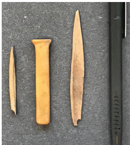
Three artifacts discovered in 2021 by McGrath students from the Tochak site: bone awl, labret and bone awl (black pencil for scale).

Recent archeological work at the Tochak site in McGrath has produced a broader story of ancient lifeways in the Upper Kuskokwim River. Located behind the McGrath School on MTNT land, the site has evidence of at least two different subsistence camps dating around 300 and 500 years ago. Both camps were buried by river flood deposits soon after the camps were occupied and contributed to excellent preservation of subsistence remains.