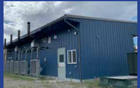
McGrath Light & Power, Est. 1978