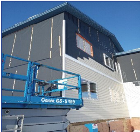
Scammon Bay Teacher Housing Trim Install

While it's too early to report MTNT's 2022 financial results until the annual audit is complete and the Annual Report is published, I am happy to report that 2023 started off without a hitch. In January, MTNT was awarded the Department of State, Bureau of Overseas Building Office project to provide fire protection and mechanical system upgrades in Gaborne, Botswana, Southern Africa. MTNT was also notified that it was awarded a second five-year contract